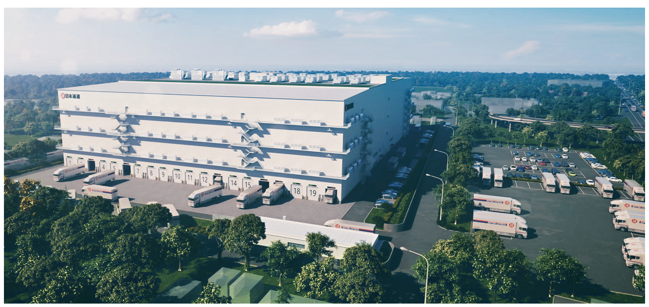
The company's dedicated pharmaceuticals centers currently under construction will feature indoor truck loading and unloading berths, along with a number of innovations for maintaining quality.

Delivering pharmaceuticals from the factory without affecting quality along the way. Given growing demands for safe and secure pharmaceuticals around the world, Nippon Express has begun building a supply network for pharmaceutical logistics, with the vision to become a platformer in pharmaceutical logistics and distribution.