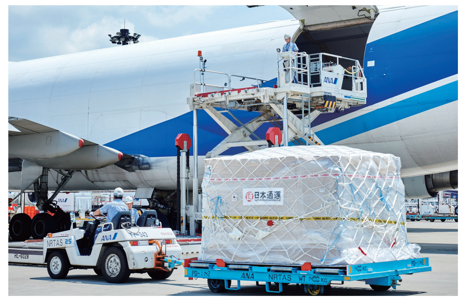
Building a logistics system that can swiftly respond to changes in industrial structure