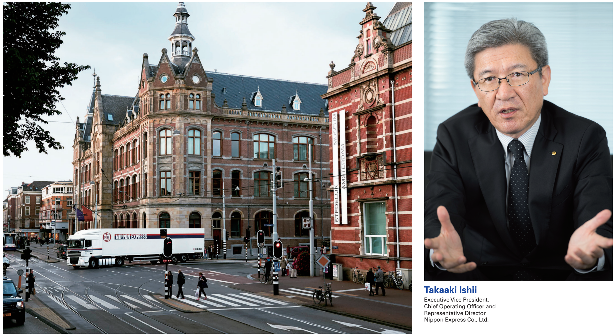
Nippon Express operates an international logistics network (pictured is Amsterdam, Netherlands)

Nippon Express is evolving its global business strategy. This involves shifting to industry-specific logistics platforms from its conventional client-specific optimization to build a business structure that can adapt quickly to changes in industrial structure. This will position Nippon Express to provide one-stop "optimized solutions" to global supply chains that are becoming broader and more complex.