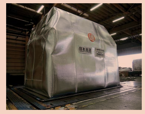
TempSure is a temperature-managed service for transporting pharmaceutical and food products by air.

All these steps mean that the 20 per cent of its turnover that Nippon Express currently generates overseas is set to rise fast. "Building on our track record of serving demanding Japanese customers, we offer high-quality solutions tailored to individual customers—something that our competitors find hard to do," says Saito. The company's long-term goal is to raise its overseas sales ratio to 40 or even 50 per cent of the total. And as it pushes ahead with its transformation strategy, Nippon Express is already well on the way to becoming a "truly global logistics company."